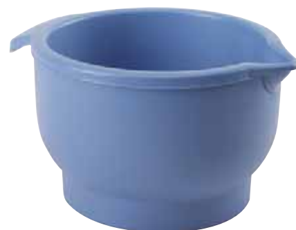
Large Cool-It bowl for flasks up to 2 litres