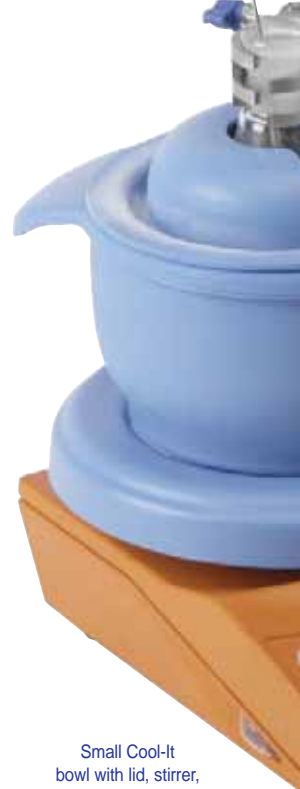
Small Cool-It bowl with lid, stirrer, stand and digital thermometer

Cool-It bowls are manufactured from a robust, chemically resistant HDPE casing encapsulating a high quality insulated foam core. The combination of tough composite materials not only provides excellent insulation but is also durable, and unlike fragile glass dewars, Cool-It is virtually unbreakable if dropped.