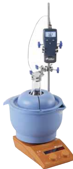
Large Cool-It bowl with lid, stirrer, stand and digital thermometer