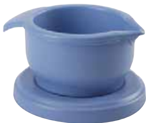
Small Cool-It bowl for flasks up to 400ml

The safest and most efficient way of cooling and stirring round bottom flasks to -78^{\circ}\text{C} .