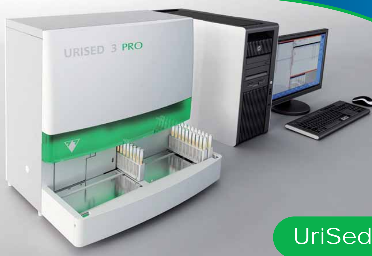
UriSed 3 PRO