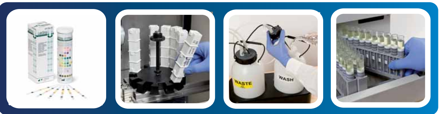
LabStripU11 Plus GL test strips for LabUMat 2 (closed system)