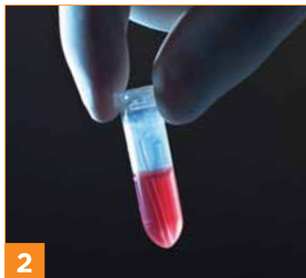
2 Place capillary into cup and invert until mixed.