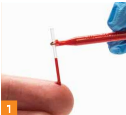
1 Collect 20 µl blood sample in capillary.