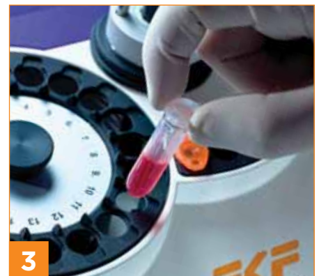
3 Result in 20–45 seconds.