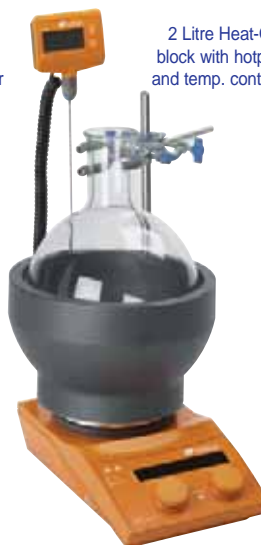
2 Litre Heat-On block with hotplate and temp. controller