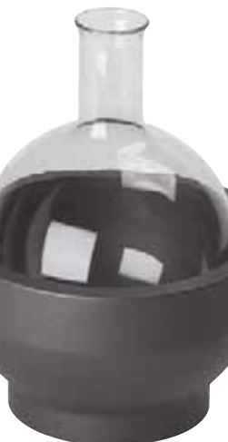
5 Litre Heat-On block