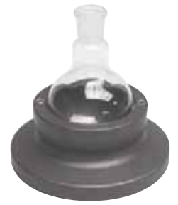
250ml Heat-On block

Each Heat-On block (250ml, 500ml, 1 litre, 2 litre, 3 litre & 5 litre) is a stand-alone product that can be placed directly onto your stirring hotplate - these blocks do not use reducing inserts to accept smaller flasks, thereby maximising heat transfer from a single piece design. All single well blocks feature two probe holes and accept the optional safety lifting handles.