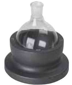
500ml Heat-On block