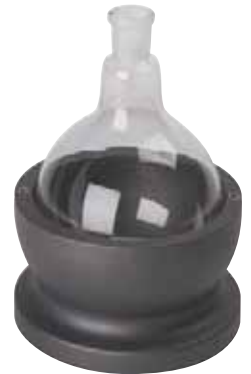
1 Litre Heat-On block