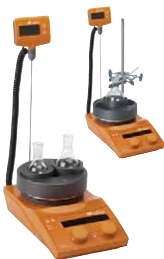
Multi-well Block Holder can accept one or two inserts as required.