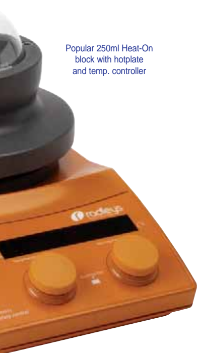
Popular 250ml Heat-On block with hotplate and temp. controller