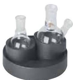
Heat-On Multi-well Block Holder with 50ml and 100ml flask inserts