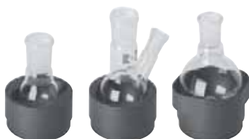
Multi-well flask inserts are available for 10ml, 25ml, 50ml, 100ml & 150ml flasks