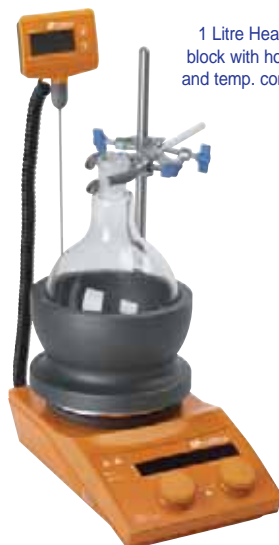
1 Litre Heat-On block with hotplate and temp. controller